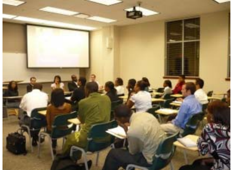
Representatives of the Ernst & Young accounting firm discuss the CPA exam during the 2009 spring semester with NABA members.

The chapter's charity community is also working with the local HOPE Community, an organization that helps those transitioning out of homelessness in Tallahassee to schedule play dates with children.