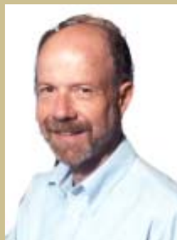
Bill Hillison Core Values Award