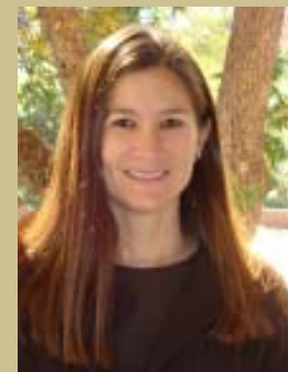
Holly Sudano Core Values Award